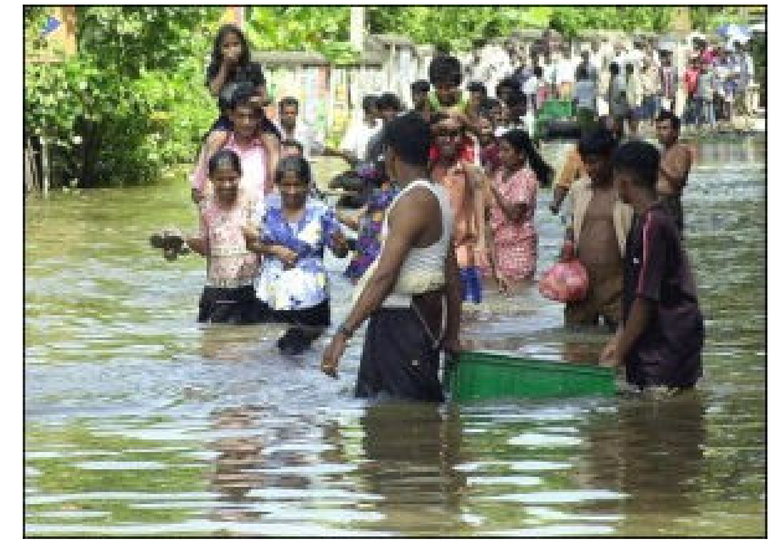
Picture showing flood inundation in Northern and Western Sri Lanka

Flood inundation map was prepared using this data, based on ISODATA classification procedures. Preliminary results show that areas of Polonnaruwa, Ampara and Batticaloa areas have been worst affected which has inundated farmland and destroyed rice fields.